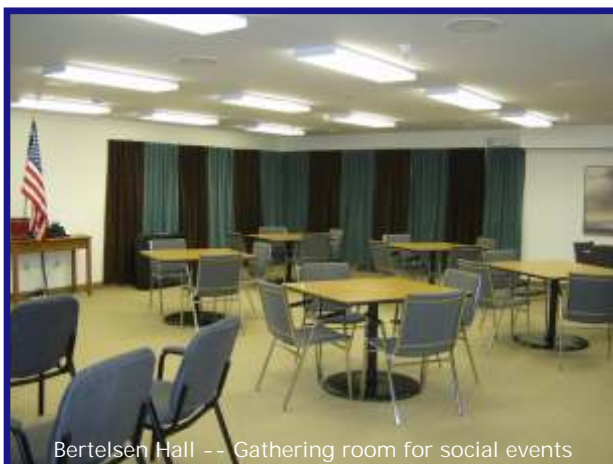
Bertelsen Hall -- Gathering room for social events

For more information, please contact us at: 834-3587 Office Hours: M-F 9 AM - Noon