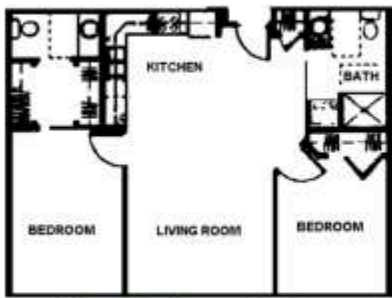
Two Bedroom Unit (Approx. 880 Sq. ft.)

Good Shepherd Apartments is a non-smoking facility.