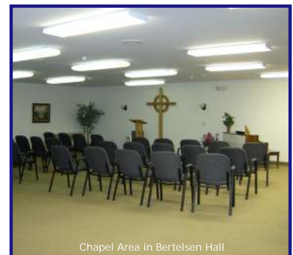
Chapel Area in Bertelsen Hall

Good Shepherd Foundation believes that a warm environment is as important as a pleasant place to live. Individuality and a sense of community make up the foundation of Good Shepherd Apartments.