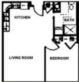
One Bedroom Unit (Approx. 612 Sq. Ft.)

History: The congregation of the Lutheran Church of the Good Shepherd, recognizing a need on the west side of Eau Claire for affordable, comfortable senior housing, incorporated Good Shepherd Lutheran Foundation. The Foundation's mission was to build and operate a senior apartment complex.