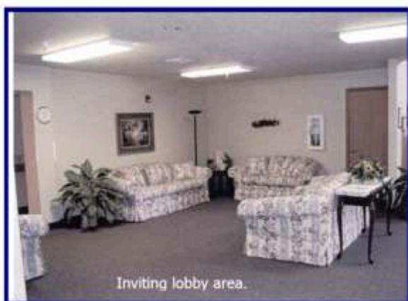
Inviting lobby area.

Our apartments were specifically designed to enhance the comfort of our residents. At Good Shepherd, we strive to create an atmosphere of community and friendship.